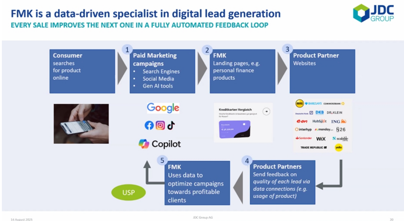
Exhibit 2: FMK's business model

For JDC, it has become important to gain more control over the volumes on the platform. JDC had been largely dependent on third parties (like the savings banks/cooperative banks/insurers) and wanted to change that. With a lead generator, it gains much more control over the front end of the platform.