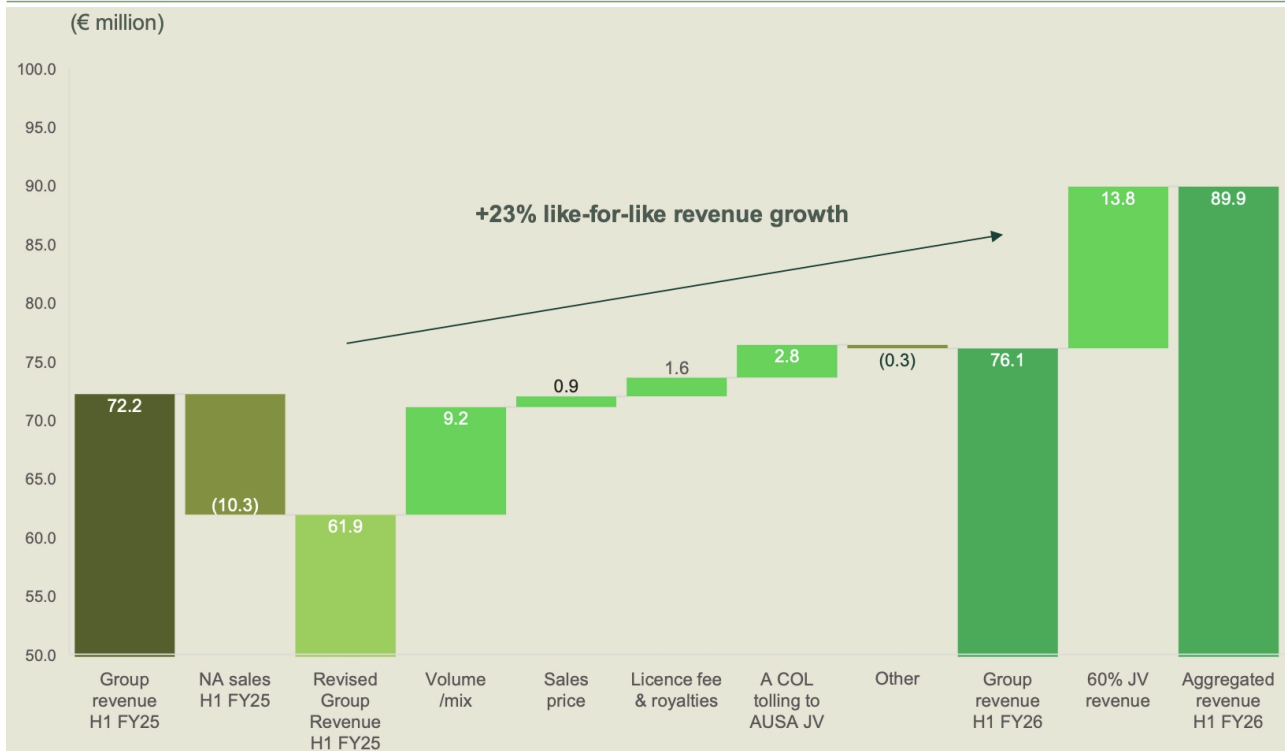
Exhibit 2: Revenue bridge H126 versus H125

As can be seen in Exhibit 2, Accsys reported €2.8m revenues related to colour tolling: Accoya that is made in the US is sold and sent to Barry, UK, for colouring and then sold and sent back as Accoya Color to the Accoya USA JV. Arnhem produced Accoya is coloured in Barry, but is sold to European customers, and not sold to the US. Since the JV is treated as an external company for reporting purposes, the transactions between the JV and Accsys Group are not eliminated on consolidation.