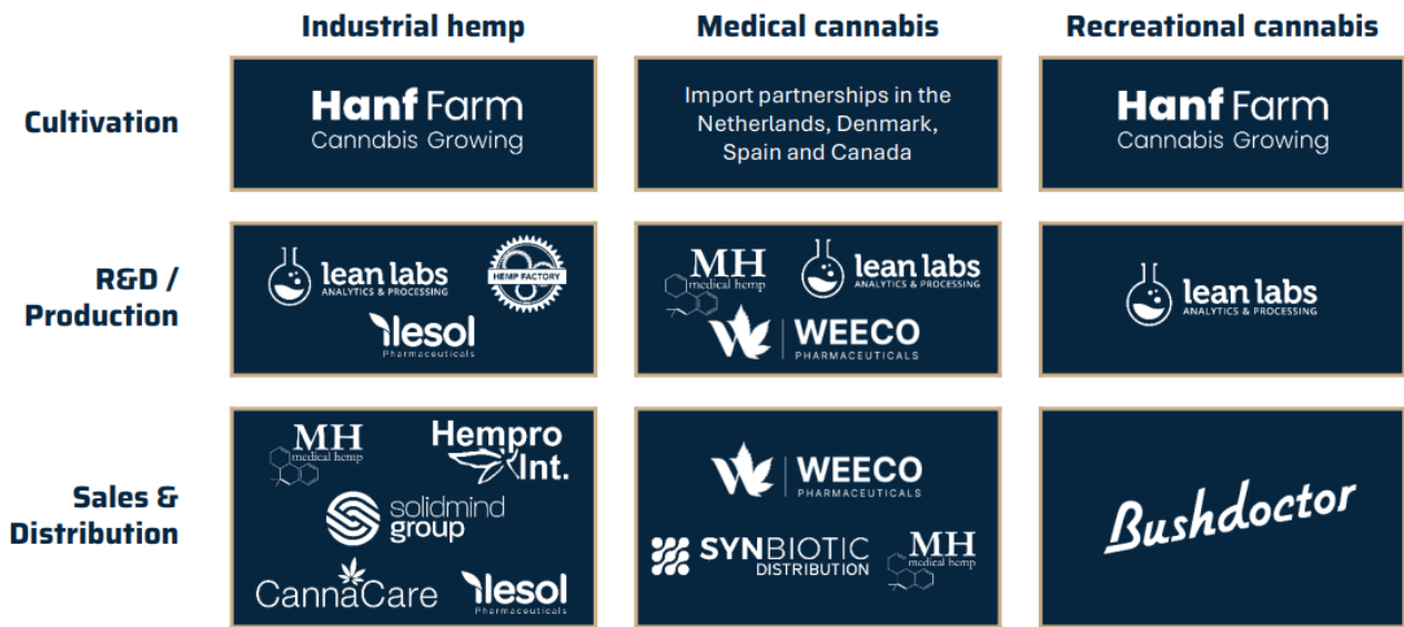
Exhibit 2: SynBiotic segments and company portfolio