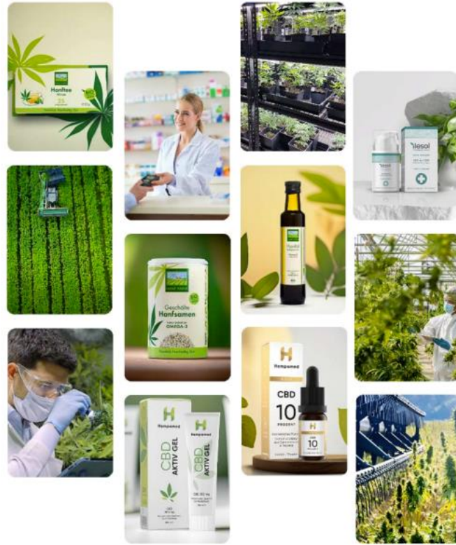
Exhibit 3: SynBiotic products